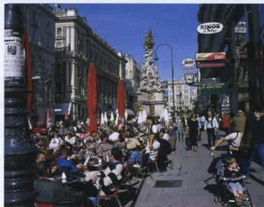
Graben, downtown Vienna