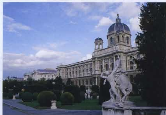
The Museum of Art History, Vienna

Located in the heart of Europe, Vienna combines the stately elegance of an old imperial capital with the vibrancy of a modern metropolis. The former seat of the Habsburg Empire, Vienna is renowned for its beautiful palaces, monuments, and museums, as well as its cozy cafes. The city of Mozart, Schubert, Mahler, Freud, and Klimt, Vienna has a rich intellectual heritage and remains one of the key centers for the performing arts in Europe. Though no longer the capital of a great power, Vienna plays an important part in contemporary international politics as the “third capital” of the United Nations and the site of important international conferences. Vienna’s close proximity and long-standing ties to such cities as Budapest, Prague, and Sarajevo have given it a unique role in the creation of a new Europe since the end of the Cold War.