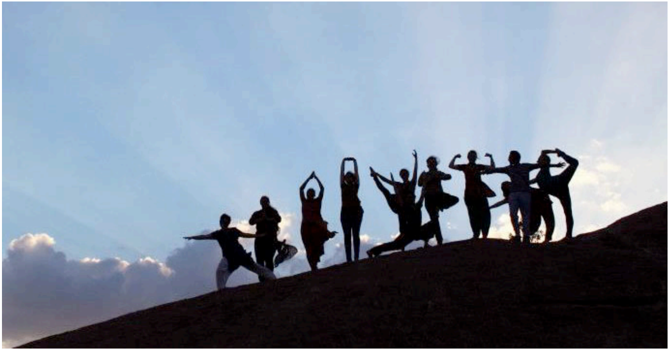
SITA students on top of a Jain hill making poses against the sky