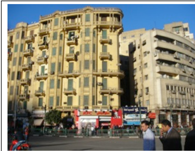
KFC in Tahrir Square, Cairo, the site of one of the largest makeshift clinics ( mustashfa maydaniyya ) erected during the uprisings. My 'informants', doctors who participated/volunteered there, talked about this site at length. It eventually became the target of state forces, as more and more citizens donated supplies and medical aid there.