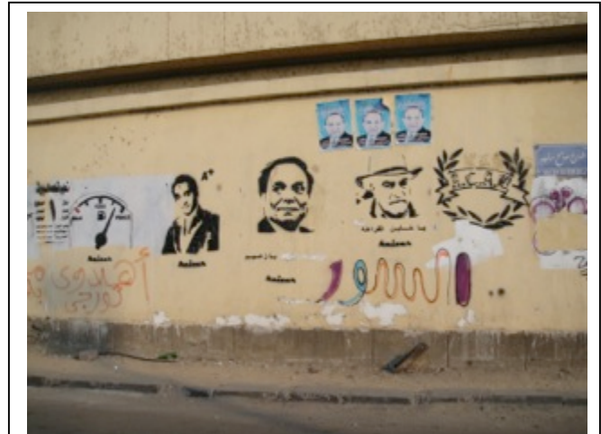
Street graffiti, of Zahi Hawass, Egyptian archeologist who is assumed to be corrupt and in line with the Mubarak government...the text under his image reads "you sold out our pharaohs."