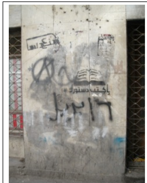
The text below the open book reads "write your constitution"...ie, no to dictatorship, referring to the new President Morsi's constitution (which grants him more powers and which sparked more protests).