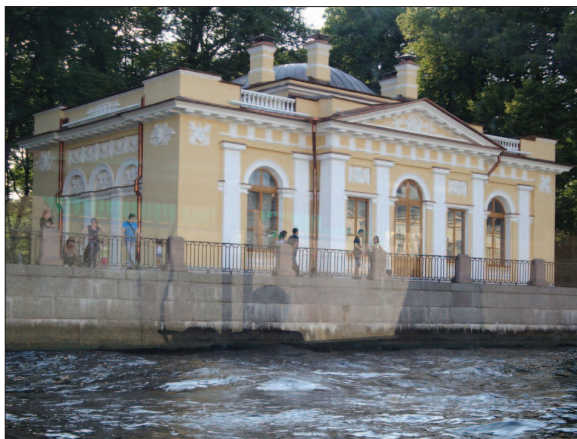
St. Petersburg is a city of canals and more than 300 bridges.

St. Petersburg is one of the most beautiful and cultured cities in the world. Founded by Peter the Great more than 300 years ago, the city was part of his project to westernize the Russian Empire and give it a new capital to rival the great cities of Europe. As you walk the city's streets, cross its bridges and stroll along its canals, the imperial vision becomes apparent. St. Petersburg has always been a city of ideas, controversies, innovations and, in the 20th century, momentous political struggles. Artists, poets, writers, musicians, scientists, architects, philosophers and revolutionaries have lived, worked, fought and thought here. Their presence can be felt in thousands of locations throughout the city, including numerous UNESCO World Heritage Sites, more than 200 museums, 70 theaters, and many classic and contemporary music and sports venues. Whether your interests are in history, arts and culture, politics or science, there is much in Peter's city for you to explore.