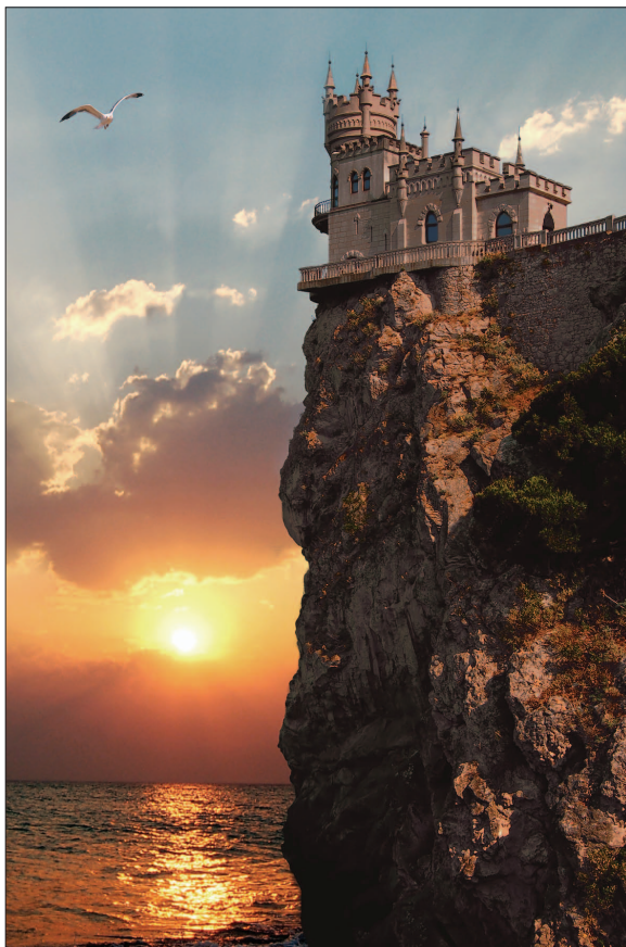
The Swallow's Nest, a diminutive castle on the Crimean peninsula in the Ukraine.