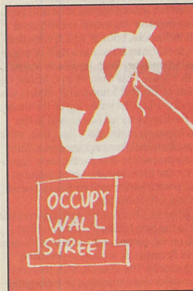
"DOLLAR TOWER" BY JEANNE VERDOUX.

The Occupied Wall Street Journal, an affinity group of Occupy Wall Street, invited a group of designer/activists to guest curate an issue dedicated to the poster art of the global Occupy movement. The