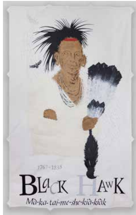
▲ Black Hawk , 2021, hand-cut paper, acrylic paint on cotton fabric, 100" x 60".