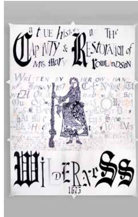
▲ Written by Her Own Hand (Mary Rowlandson) , 2017, oil paint, thread, paper on Tyvek-backed fabric, 82.5" x 59.5".