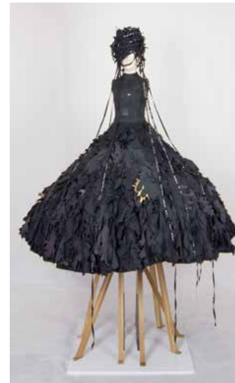
▲ The Wilderness Tattoo (Hester Prynne) , 2017, fabric, thread, Cinefoil with gold leaf, ink on wooden base, 86" x 55" x 55".

◀ Omnipotence Enough (Emily Dickinson) , 2017, oil paint on fabric, wooden yoke, and shoe lasts, 103 1/4" x 42.5" x 5".