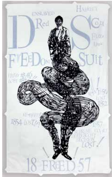
▲ Dred Scott , 2021, acrylic paint on cotton fabric 100" x 60".