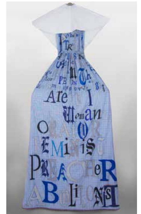
▲ Revelator (Sojourner Truth) , 2021, oil paint, thread on fabric, wooden yoke and shoe lasts, 103.5" x 37" x 3".