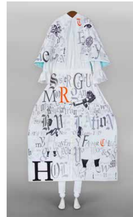
▲ Sister Gertrude Morgan , 2021, acrylic paint, hand-cut paper, thread on cotton fabric, satin, plastic sheeting, wooden yoke and shoe lasts, 100" x 42" x 6".