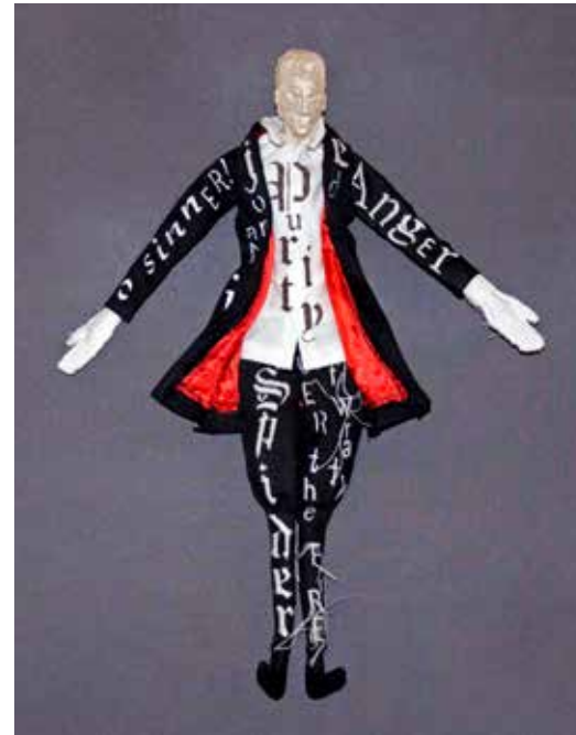
▲ Jonathan Edwards: Purity , 2018, fabric, thread, balsa wood, ink, 14" x 9" x 2".