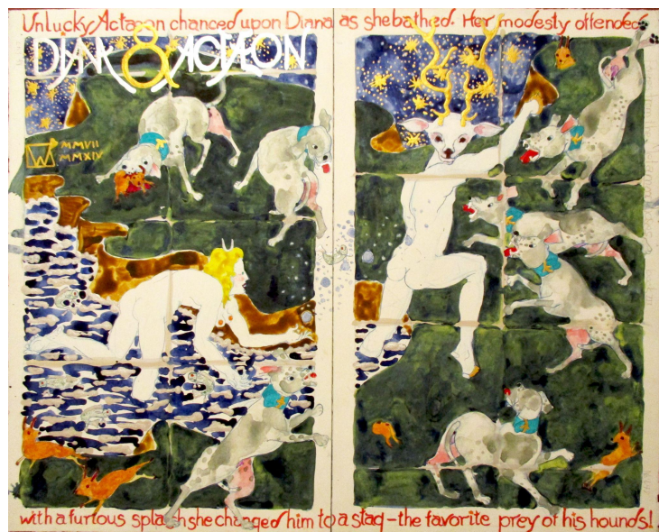
Diana & Actaeon by Wally Reinhardt, watercolor on paper, Gift of Wally Reinhardt, 2015.1.3.a-b