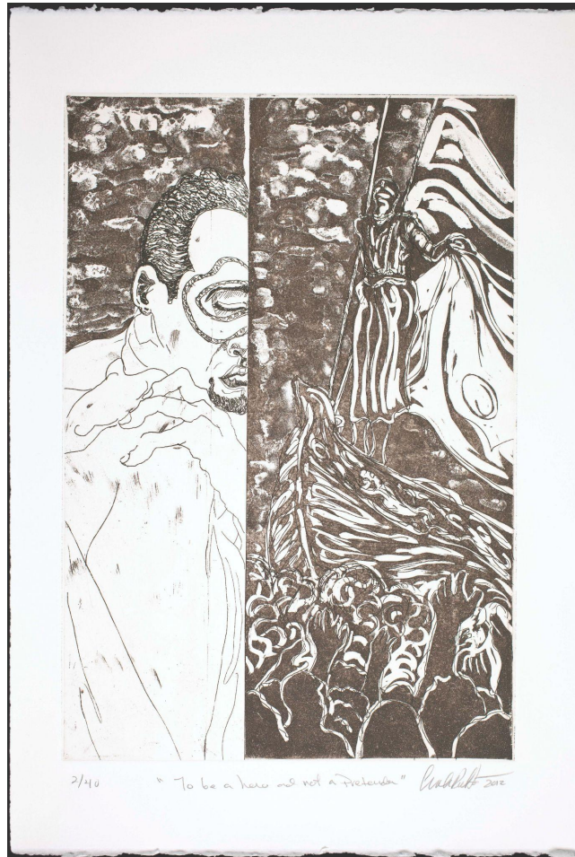
To Be A Hero and Not A Pretender , 2012, Curlee Raven Holton, Etching, Bates College Museum of Art purchase, with the Elizabeth A. Gregory MD '38 Fund, 2015.2.1.f

ENVR 341 - Political Ecology of Climate Change 3, 5