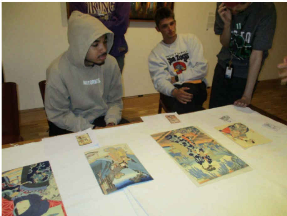
Students in ASIA S23 - Studying Asian Art in the Museum view Japanese prints.

ASIA 236 - Japanese Arts and Visual Culture 1, 5 ASIA 243 - Buddhist Arts and Visual Cultures 5 ASIA 261 - Cultural History of Japan: From Jōmon Pottery to Manga 5 ASIA 274 - China in Revolution 5