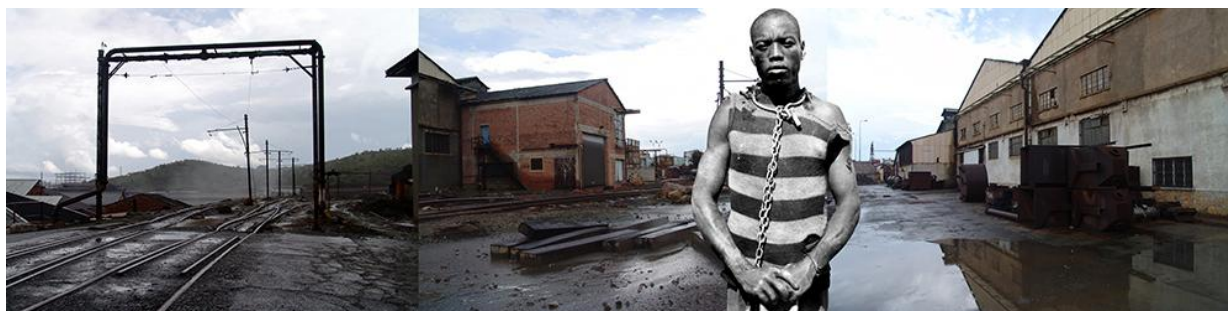
Untitled 13 , 2006, Sammy Baloji, Congolese, Archival digital photograph, Bates Museum of Art purchase with the Synergy Diversify the Collections Fund, 2019.9.1