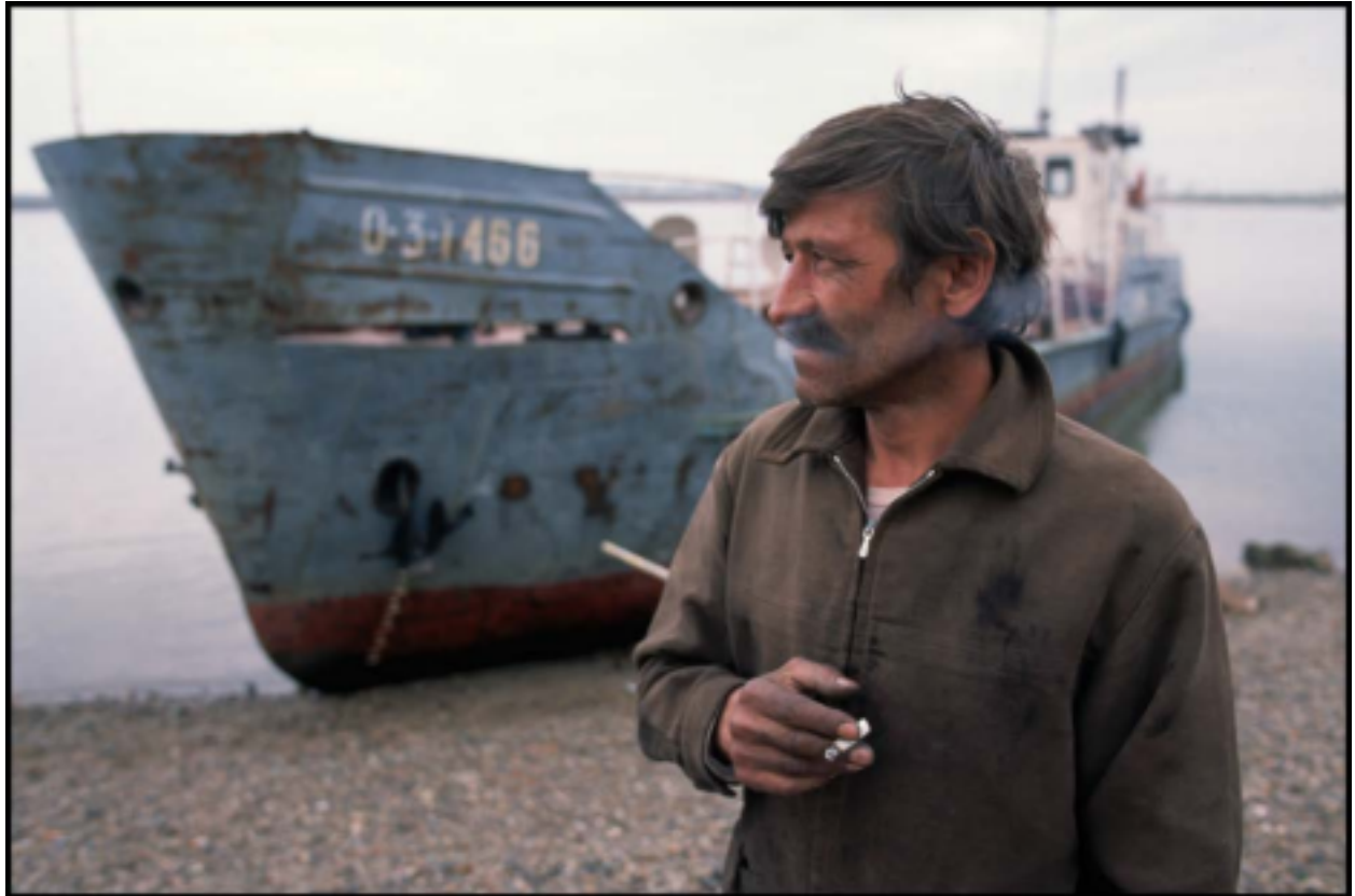
A Siberian fisherman smokes next to his fishing vessel on the shore of the Tom River, Tomsk, Russia, 1996, by Peter Turnley, Photograph, Bates College Museum of Art, 2018.13.57