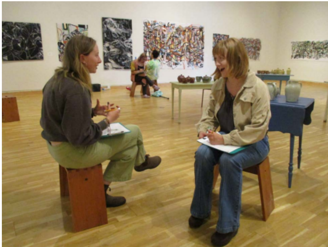
Students in AS S20: Philosophy of the Body work in teams in the Senior Thesis Exhibition, Spring 2023

AVC 457B - Senior Thesis: History and Criticism 1-9