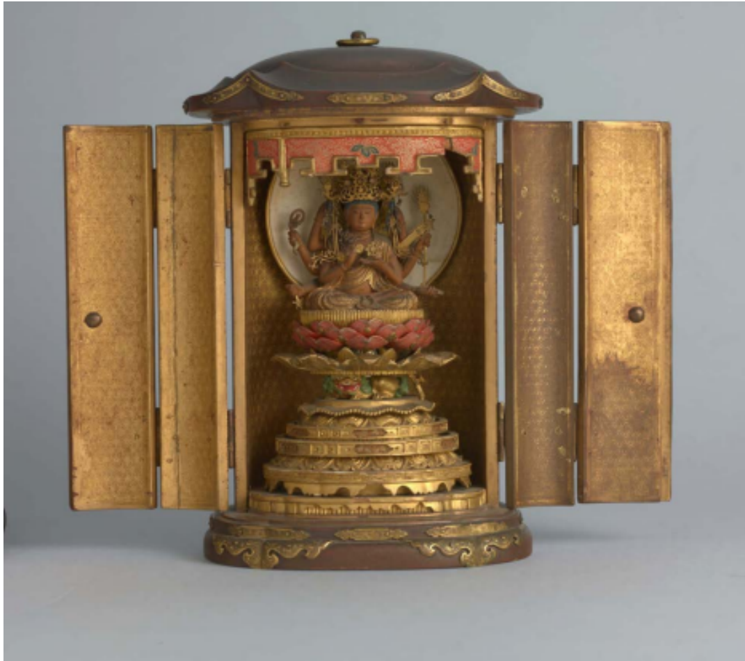
Buddhist Shrine, undated, Japan, Bates College Museum of Art, Marsden Hartley Memorial Collection, Gift of the Marsden Hartley Estate, 1951.2.86