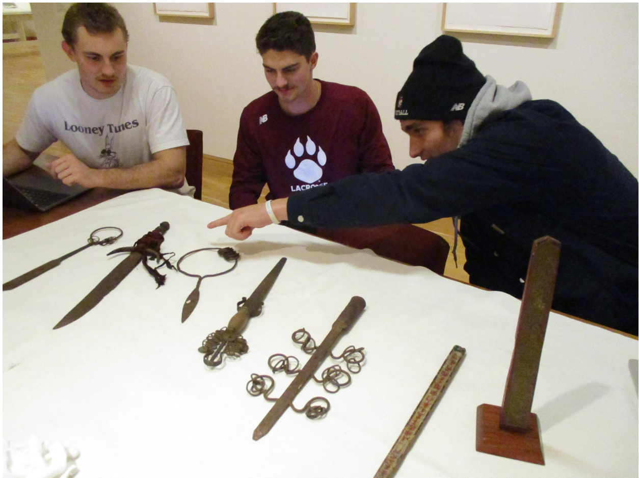
Students in HIS 399: Historical Methods discuss material culture primary sources in the collection

ANTH 333 - Culture and Interpretation 1, 2 6, 7, 12