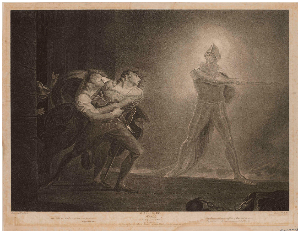
Hamlet Prince of Denmark Act I, Scene IV, n.d., R. Thew, Engraving, Bates College Museum of Art, 1984.1.4