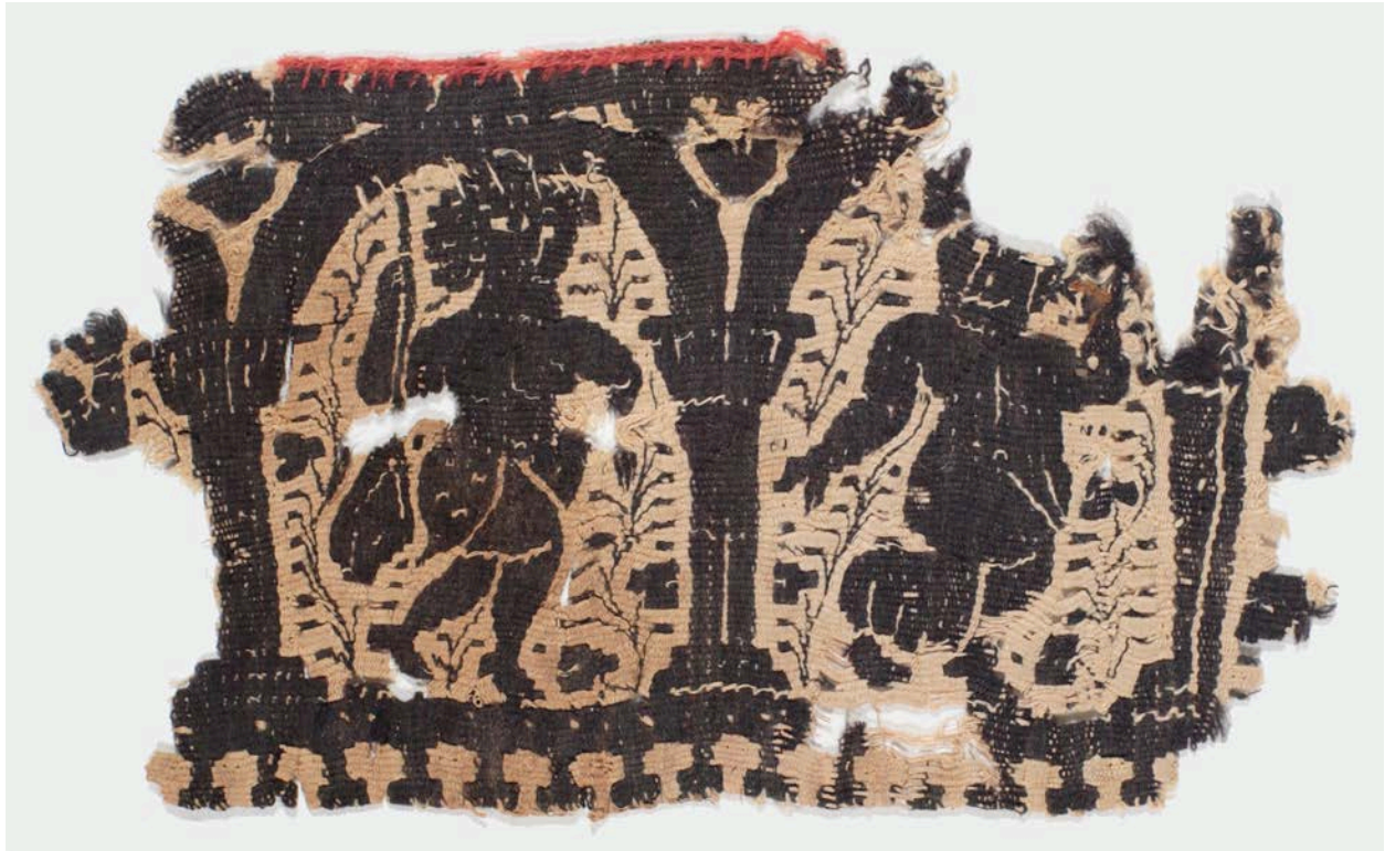
Panel with Bacchic Dancers, Early Byzantine Egypt, Bates College Museum of Art, Marsden Hartley Memorial Collection, Gift of the Marsden Hartley Estate, 1951.2.75.w

CMS 102 Medieval Worlds, 12 CMS 218 Greek & Roman Myths CMS 236 Introduction to the New Testament, 12 CMS 241 Art of Islam, 12 CMS 251 Medieval Architecture, 12 CMS 457 Senior Thesis, 12