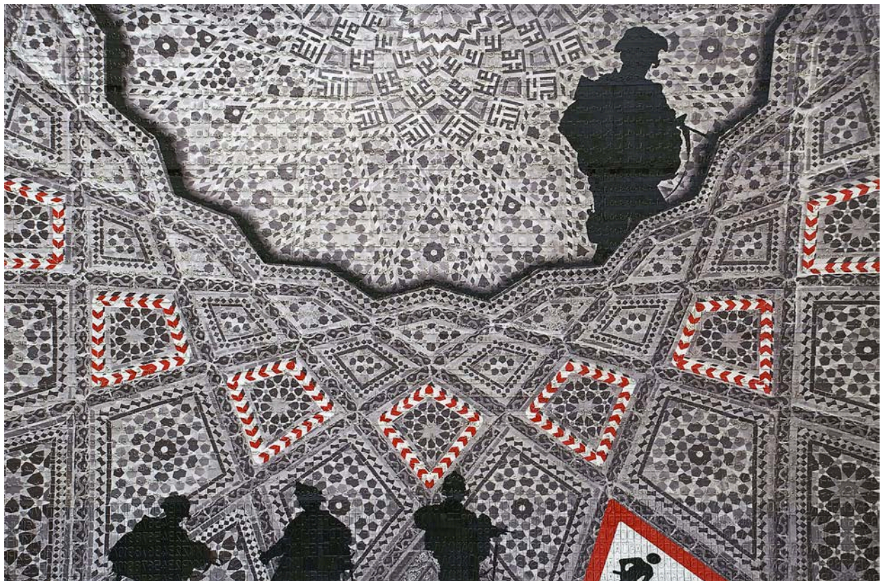
Abdulnasser Gharem, Men at Work I , Gift of the Edge of Arabia. 2017.3.2