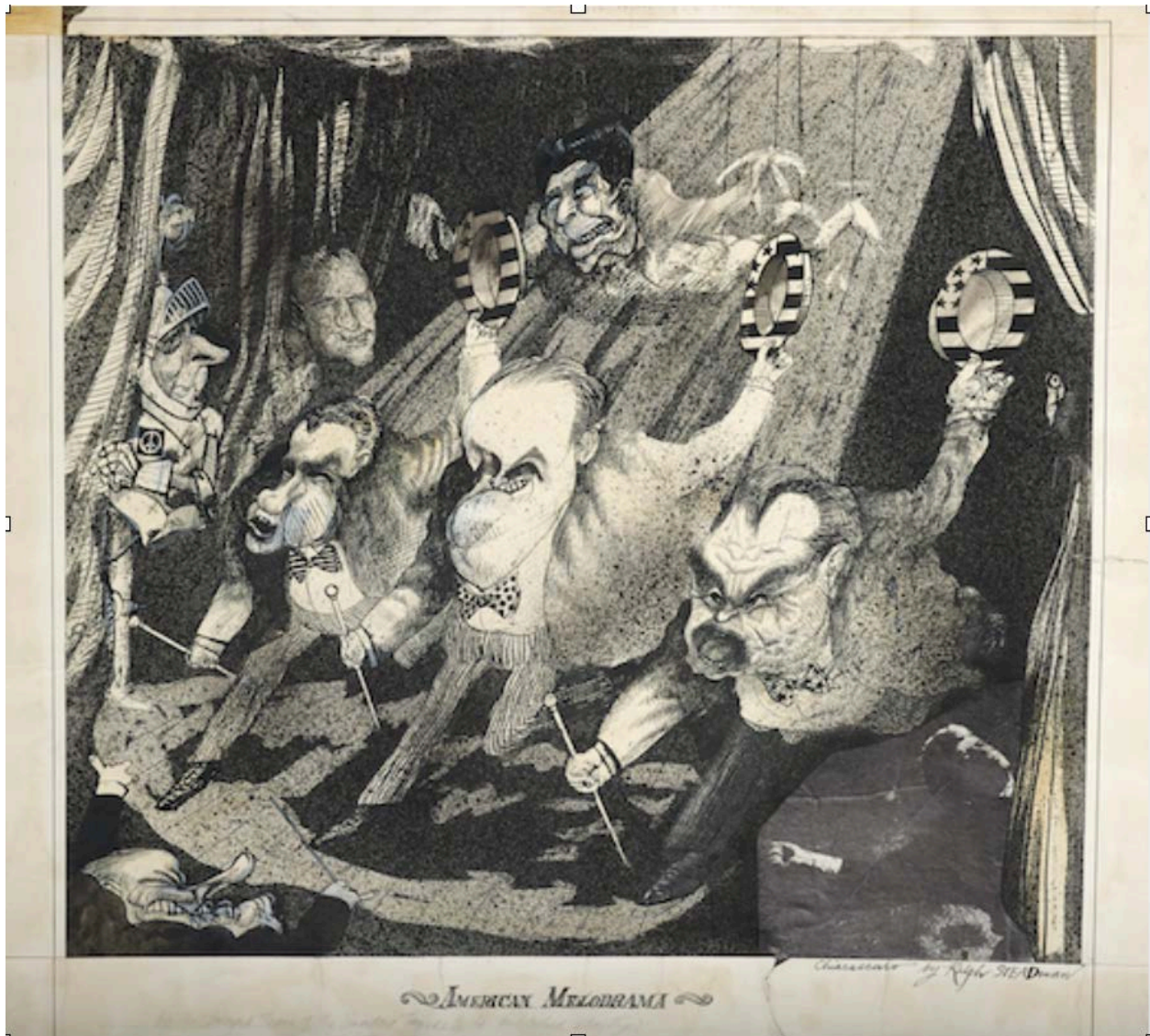
Ralph Steadman, American Melodrama