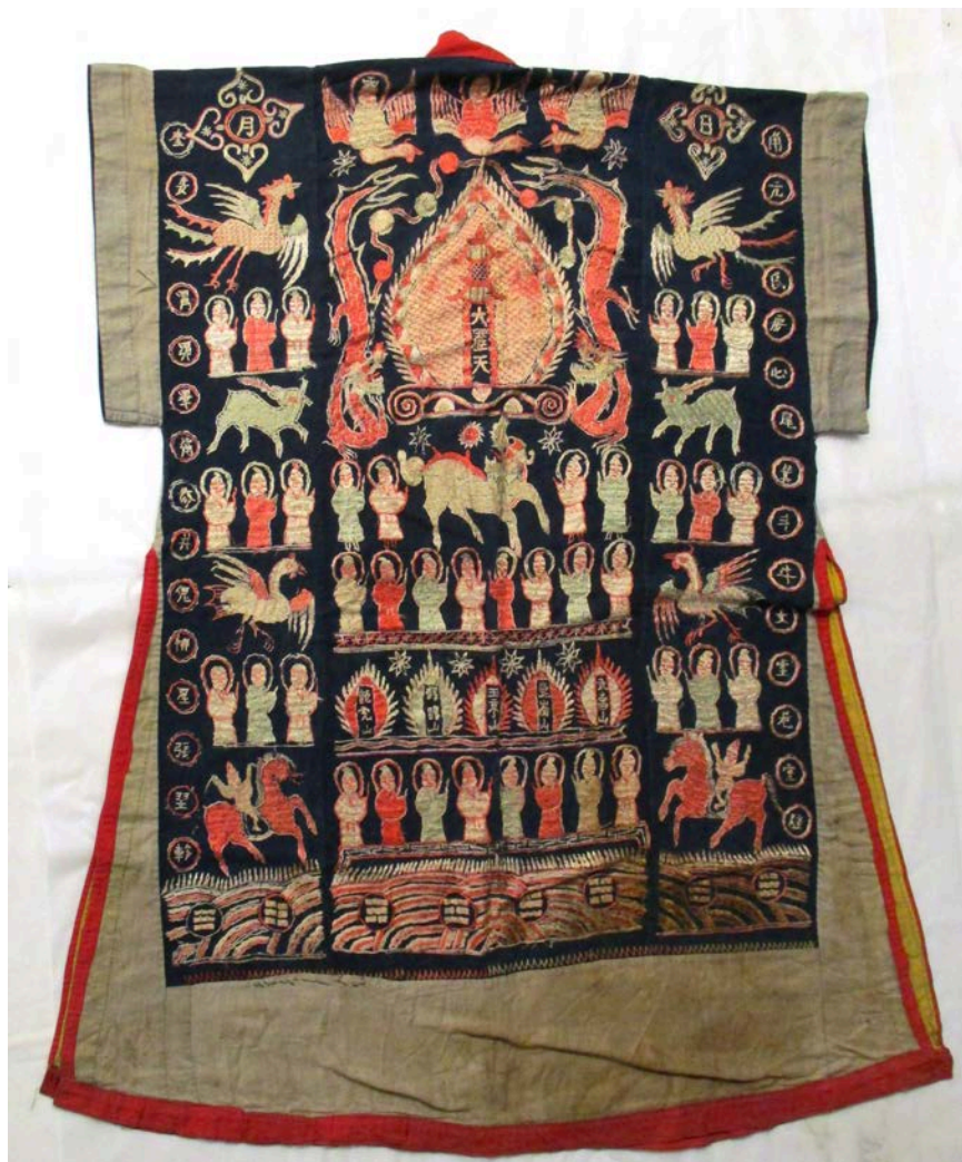
Senior Shaman Robe, Vietnam, Bates College Museum of Art purchase, 2-14.6.28