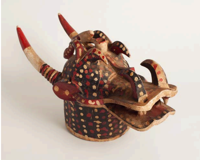
Senufo Helmet Mask, Bates College Museum of Art purchase, 2011.24.1

ASIA 161 A Cultural History of Japan, 12