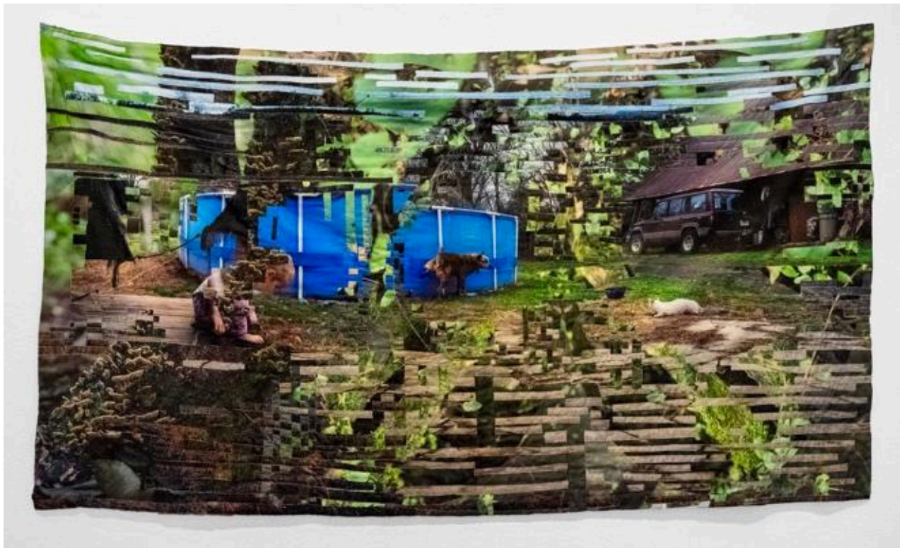
Amber Imrie, Above Ground , 2023, Archival pigment ink on cotton, batting, sewing thread

ENVR 160 Sacred Ecologies, 8 ENVR 204 Environment & Society, 8 ENVR 205 Lives in Place, 2, 8 ENVR 207 Human Impacts on Marine Ecosystems, 8 ENVR 211 US Environmental History, 8 ENVR 214 Environmental Ethics, 8 ENVR 218 Ecomedia: Audiovisual Cultures of the Environment, 8 ENVR 216 Consumerism & Beyond, 8 ENVR 381 Black Geographies: Space, Place, & Ecologies of Power, 8 ENVR 458 Senior Thesis, 8