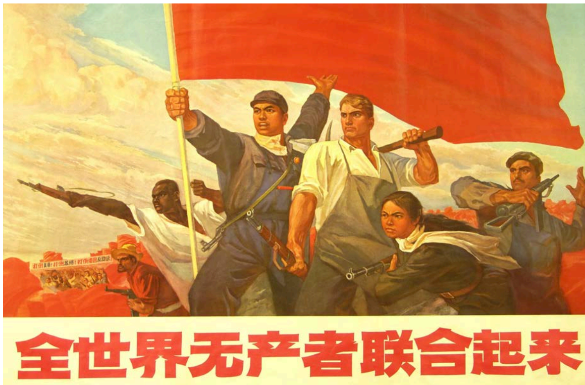
Chinese, All Proletarians Of The World Unite Together , n.d., offset lithograph, Museum Purchase with the support of Van Otterloo Fund, 2005.2.5

RFSS 100 What is Rhetoric? 8 RFSS 186 Introduction to Argumentation, 8 RFSS Social Advocacy & Activism, 8 RFSS 458 Senior Thesis, 8