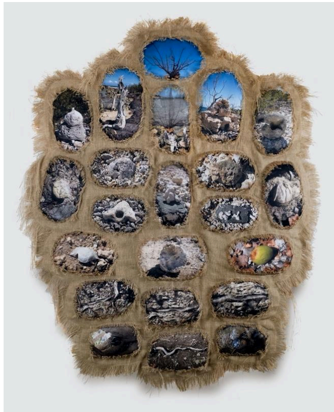
Julian Chams, Colección #6 (Cielo y rocas, Vieques) , 2023, Digital prints, batting, and jute

HISP 103 Elementary Spanish, 1, 2, 8 HISP 201 Intermediate Spanish I, 1, 2, 8 HISP 202 Intermediate Spanish II, 1, 2, 8 HISP 205 Advanced Spanish, 8 HISP 210 Writing Spanish 1, 2, 8 HISP 458 Senior Thesis, 8