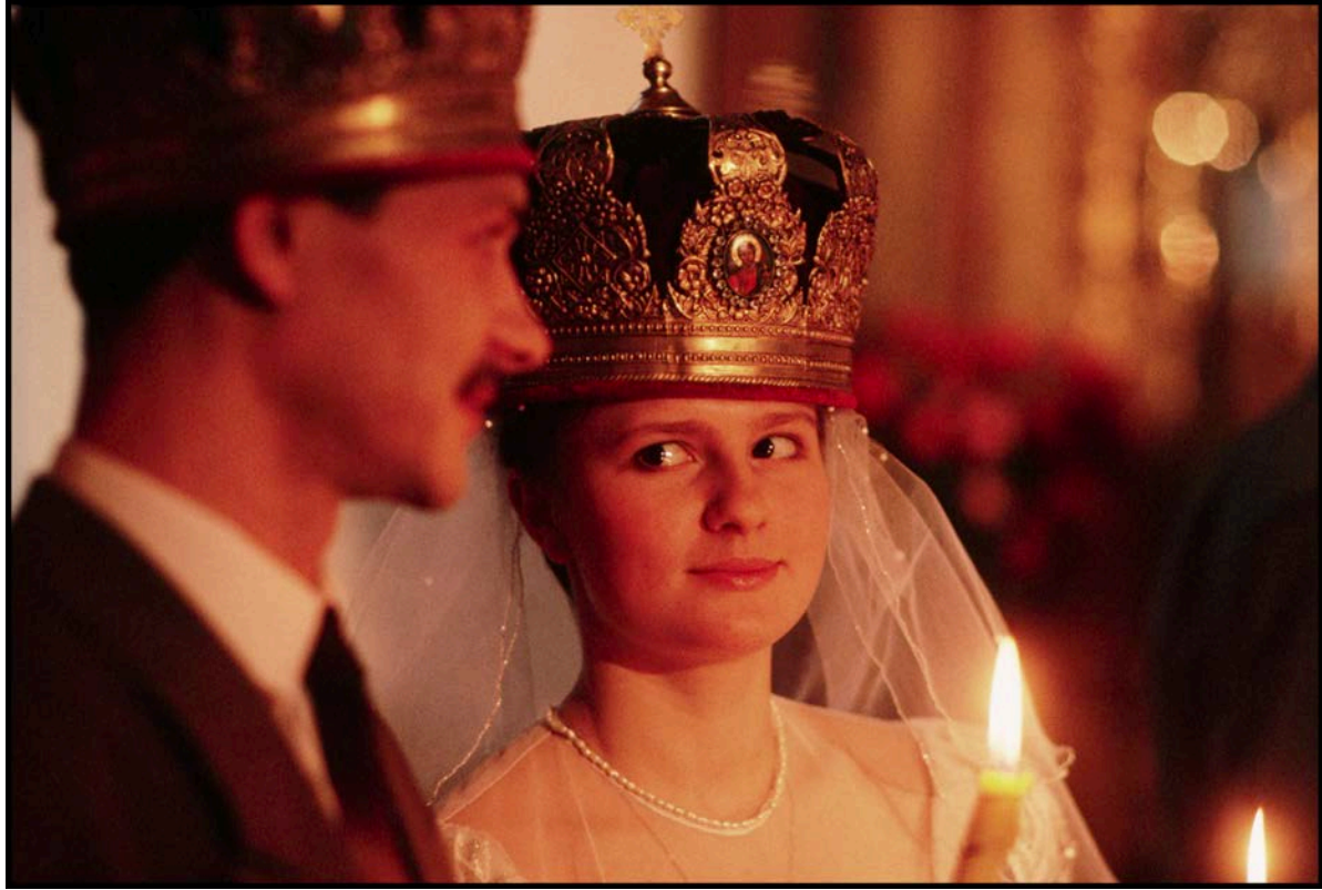
Young bride looking at groom during wedding ceremony, Chelyabinsk, Russia, 1991, Photograph, 2018.12.20

RUSS 101 Elementary Russian II, 1, 2, 8 RUSS 201 Intermediate Russian II, 1, 2, 8 RUSS 301 Advanced Russian II, 8