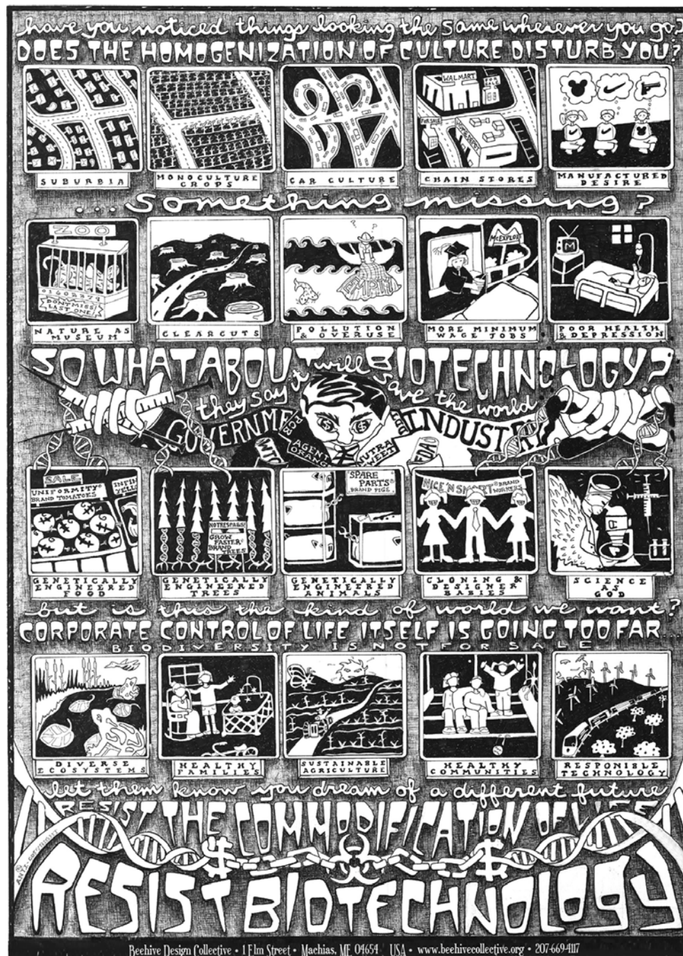
Beehive Collective, Puppeteer , 2007, Ink on Post-industrial Polymer), Museum Purchase, 2007.18.1

PHIL 213 Biomedical Ethics, 8 PHIL 214 Environmental Ethics, 8 PHIL 268 Capitalism and Its Critics, 8 PHIL 324 Virtue and Emotions, 8 PHIL 458 Senior Thesis, 8