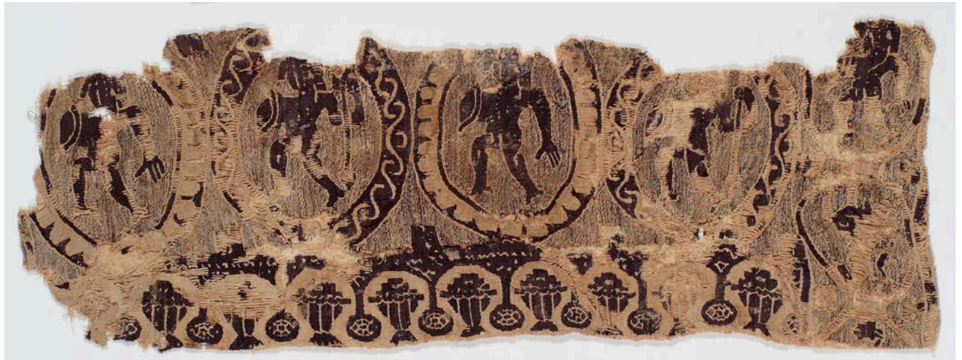
Early Byzantine Egypt, Band with Pyrrhic Dancers, 3rd-7th century CE, Linen and wool, Marsden Hartley Memorial Collection, Gift of the Marsden Hartley Estate, 1951.2.75.j