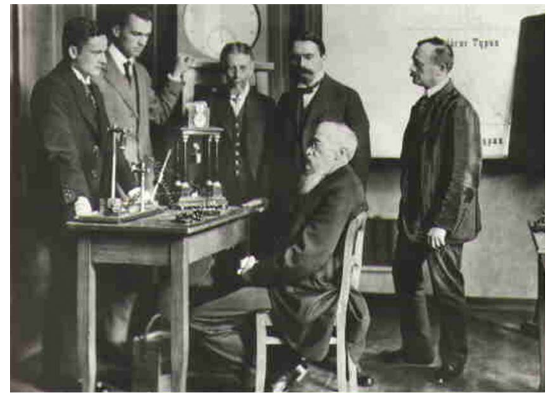
Wilhelm Wundt (seated) in a lab with students.

William James starts teaching a psychology course in the Physiology Department at Harvard in 1875.