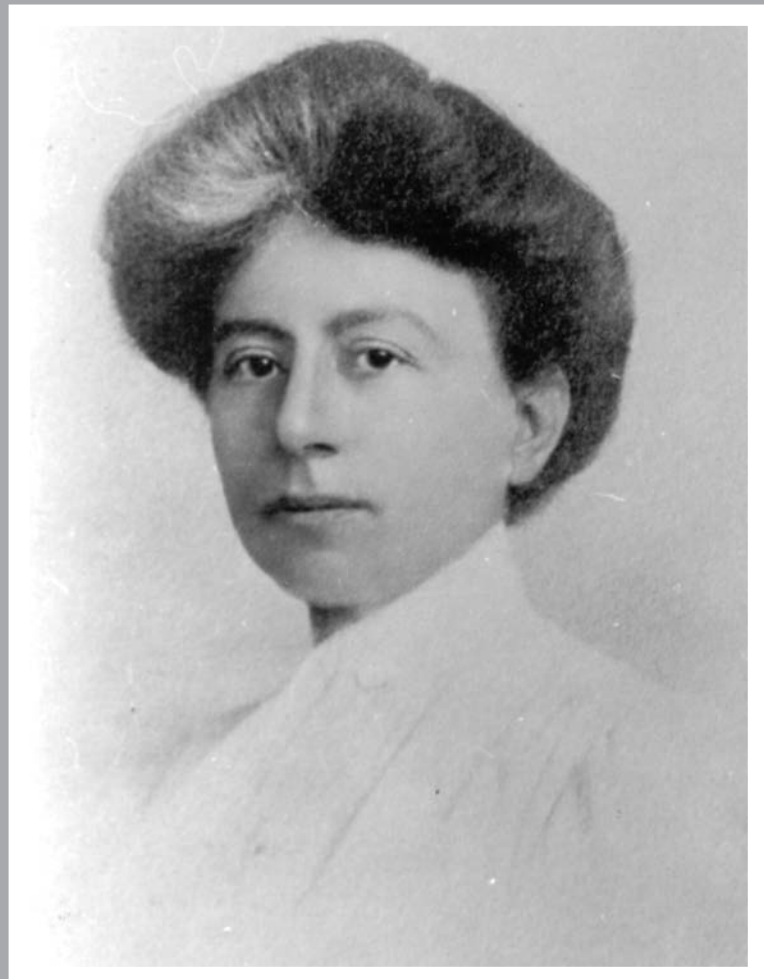
Christine Ladd-Franklin (1847-1930) psychologist and Vassar College graduate.

Ulric Neisser publishes Cognitive Psychology in 1967, adding to the cognitive turn in psychology.