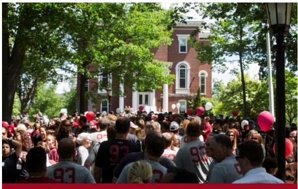
Reunion Volunteer Website

Refer to the Reunion volunteer website for links to Reunion records, case for the Bates Fund, Reunion Weekend and fundraising FAQs, tips and templates, and more.